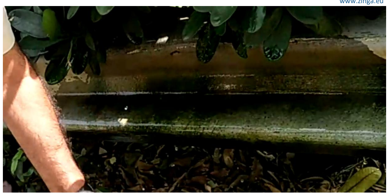
Conclusion: after 13 years, ZINGA is still intact and NO Corrosion was found.