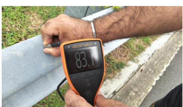
Condition survey of KAMPONG JAVA Road Rails in December 2017, 13 years after ZINGA application.