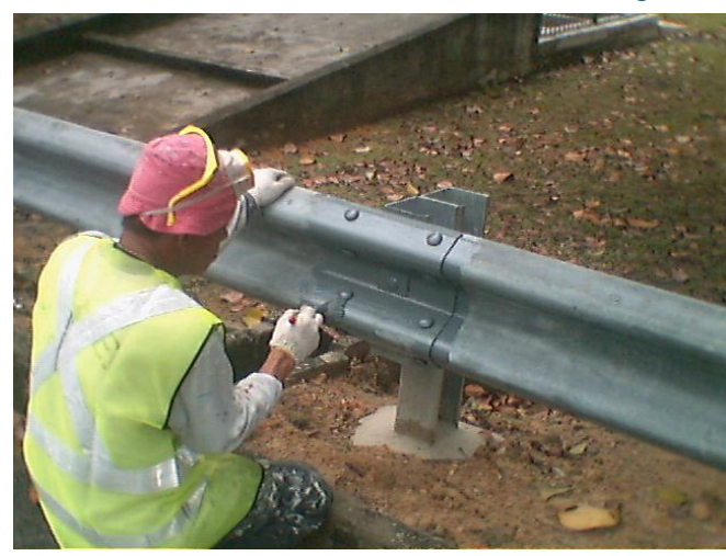
Condition survey of ECP SERVICE Road Rails in December 2017, 13 years after ZINGA application.